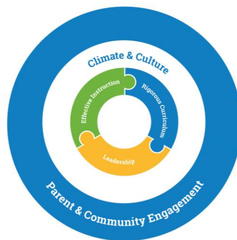
Figure 1. Schoolwide Reform Theory of Action

Strong leadership and empowered teachers are able to rally support and organize for action resulting in improved student outcomes. The five dimensions of school improvement address a system-wide approach that not only